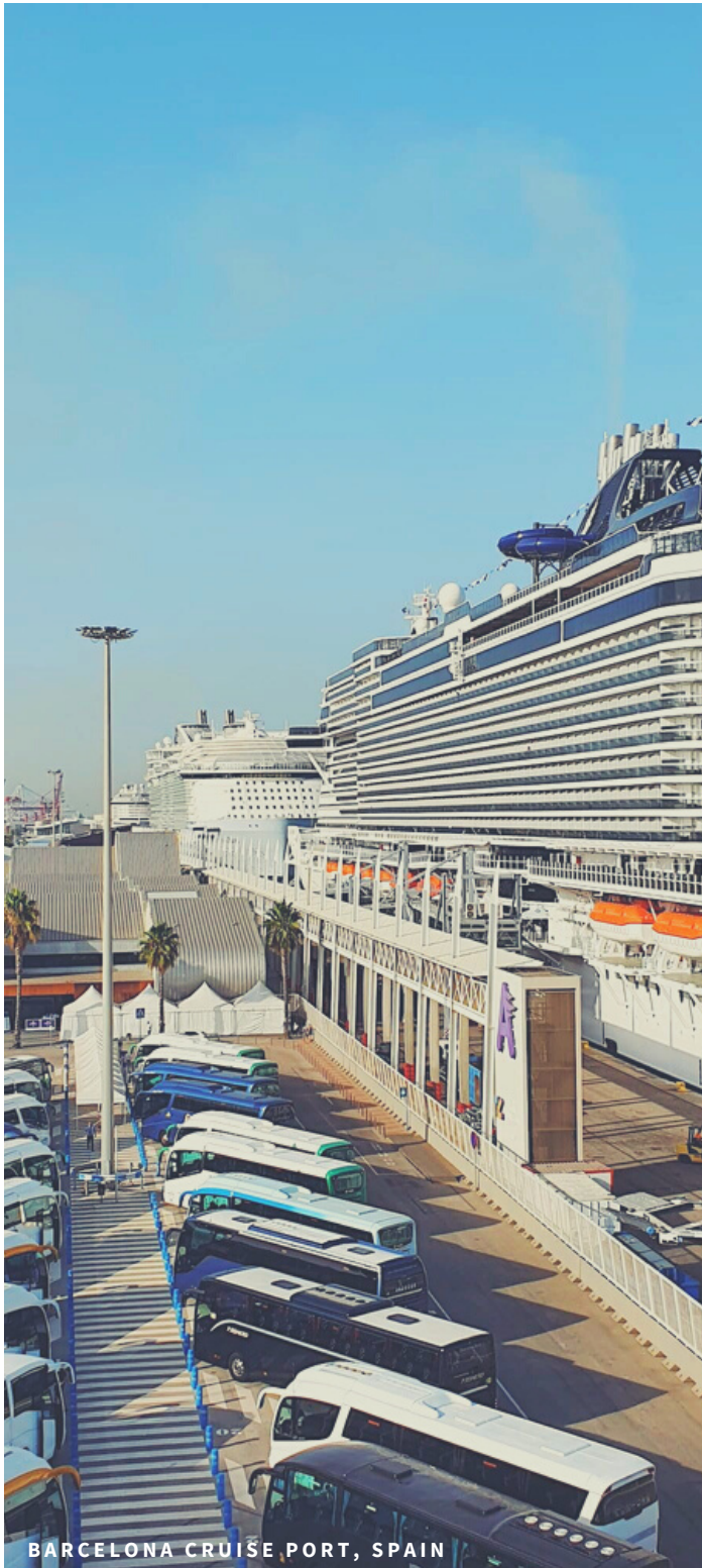
BARCELONA CRUISE PORT, SPAIN